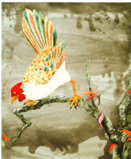
Laura Owens, Untitled (LO 270) , 2004

Color spit-bite aquatint and soft-ground etching 29 1/2 x 35 1/2 in. (image), 39 1/2 x 44 1/2 in. (sheet) Printed by Dena Schuckit Gift of Crown Point Press 2006