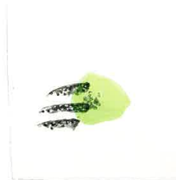
Richard Tuttle, Costume B , 2002

Spit-bite aquatint and soap-ground aquatint 44 7/8 x 22 13/16 in. (each image), 53 1/8 x 30 1/2 in. (each sheet) Printed by Brian Shure Gift of Crown Point Press 1992.167.1060 1992.167.1062