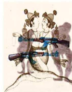
Shahzia Sikander, No. 2, Entangled , 2001

Color spit-bite aquatint and sugar-lift aquatint on smoked paper 47 13/16 x 35 1/4 in. (image), 54 1/8 x 41 1/4 in. (sheet) Printed by Pamela Paulson Gift of Crown Point Press 1991.28.1336