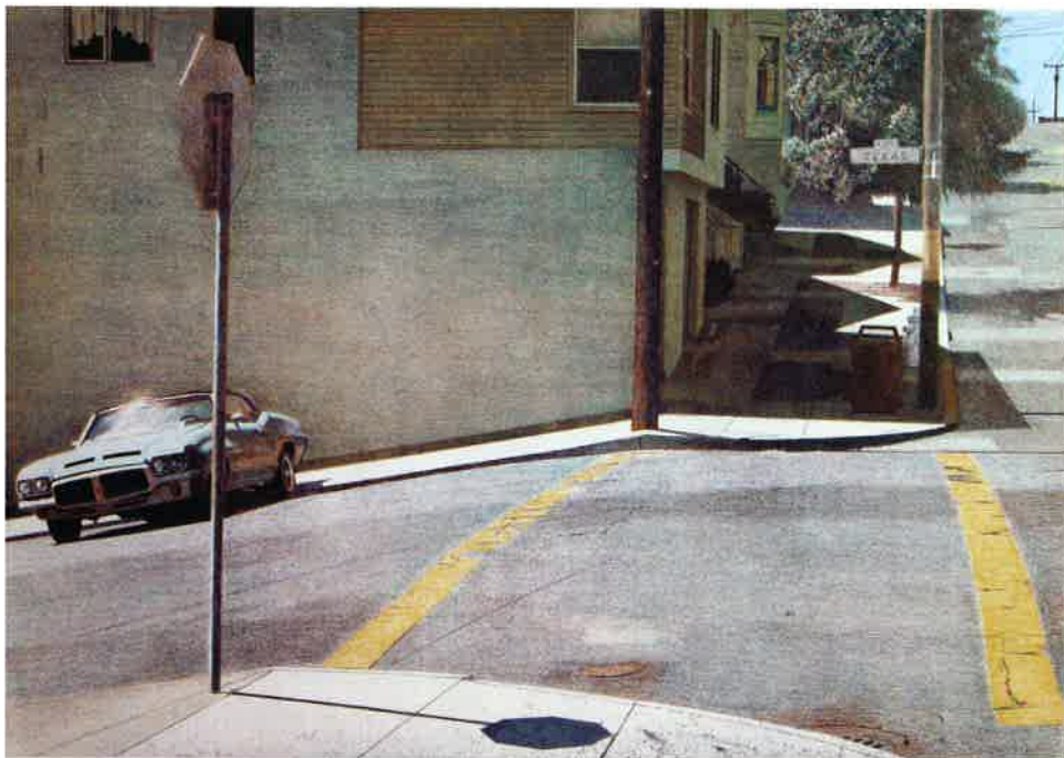
Robert Bechtle, Texas and 20th Intersection , 2004